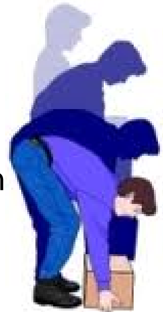
Poor lifting technique

If a load is just too large, heavy or awkward to carry, don't take unnecessary risk. Get someone to help you.